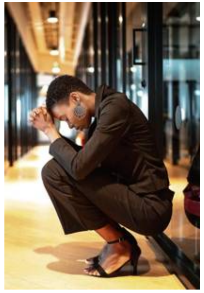
Too many factors of moderation have reversed in recent times

But the Great Moderation started to crack during the Great Recession and was then hit by covid. In both cases, inflation initially remained low, given demand shocks, and loose monetary, fiscal and credit policies prevented deflation. But inflation is back, rising sharply, owing to a mix of both demand and supply factors. On the supply side, the backlash against globalization has gained momentum. Public anger over stark inequalities also has been rising, leading to more policies to support workers that are now contributing to a spiral of wage-price inflation. Making matters worse, renewed protectionism has restricted trade and the movement of capital. Political tensions are driving a process of re-shoring. Political resistance to immigration has curtailed the global movement of people, putting upward pressure on wages. Strategic considerations have further restricted flows of technology, data and information. And new labour and environmental standards, important as they may be, have hampered production. This balkanization of the global economy is deeply stagflationary, and it is coinciding with demographic ageing, not just in developed countries, but also in large emerging economies such as China. Because young people tend to produce and save, whereas older people spend down their savings, this trend also is stagflationary.